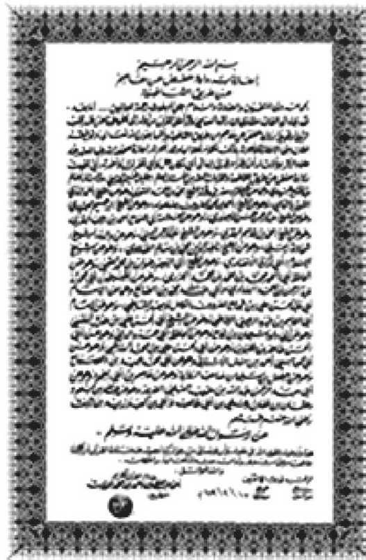
Verses from the standard version of the Qur'an which is derived directly from the Qur'an authorized by Uthman who ordered the destruction of all other versions.